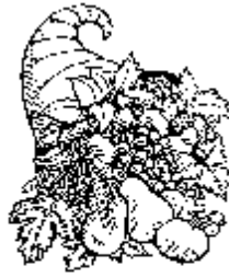
Every good and perfect gift is from above.